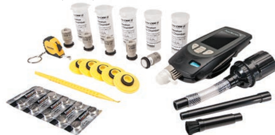
PosiTector CMM IS Pro Kit includes the PosiTector DPM Advanced

Replacement chambers, salt solutions, tools, caps and fins are available upon request